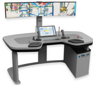
Mevea Remote Operation Station

All simulator platforms can have VR/MR visualization option